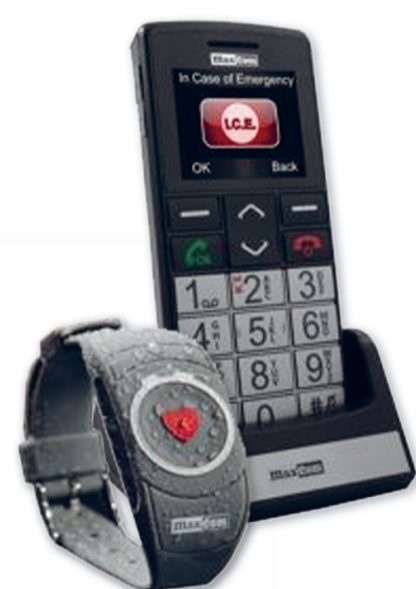
Senior phone with SOS bracelet