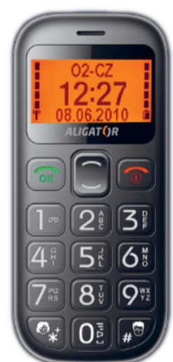
Senior telephone Aligator