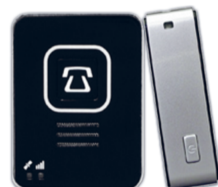
Surveillance assistant Lola